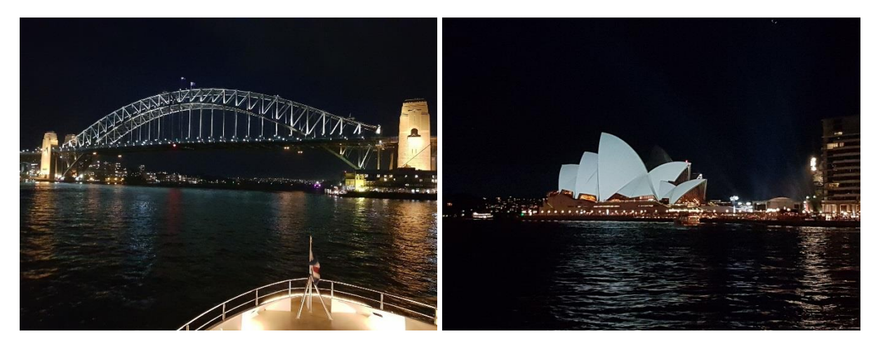
Figure 8: The cruise included sights of Darling Harbour, the iconic Sydney Harbour Bridge (left) and Opera House (right). After the dinner cruise, the participants continued discussions at the Opera House.