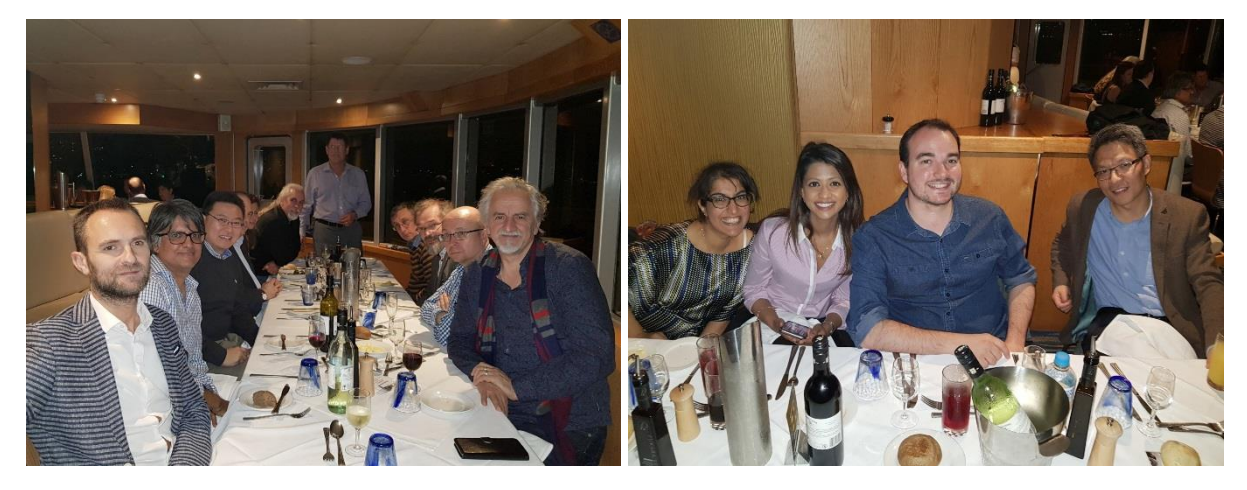
Figure 7: Workshop dinner at the bow of the ship; discussions ensued whilst touring Sydney Harbour