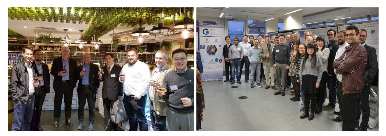
Figure 3: Pre-dinner drinks and discussion amongst workshop participants at the National Wine Center (left) and evening poster session/dinner at the University of Adelaide

The evening activities included a BBQ dinner at the University of Adelaide, followed by a poster session from the postdocs and students based at the ARC Graphene Hub.