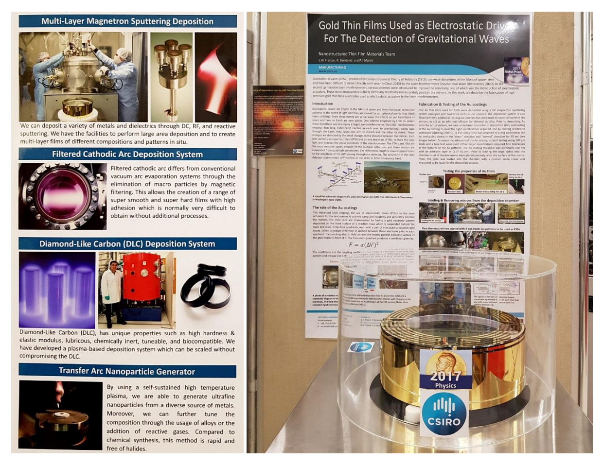
Figure 9: Visit to the labs of CSIRO Lindfield. Besides the Graphene labs, the participants also saw the advanced material deposition capabilities offered by the thin film lab (left). In particular, high precision gold electrostatic drivers were fabricated at this facility for the Laser Interferometry Gravitational Observatory (LIGO); gravitational waves were observed with these detectors, recognised by the 2017 Nobel Prize being awarded for this work.

Following lunch, the participants were taken to CSIRO Lindfield for a visit of the labs.