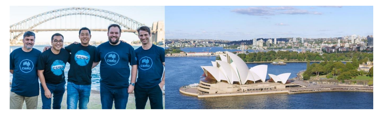
Figure 4: From 18-19 October 2018, the workshop was hosted by CSIRO (left) in Sydney (right).